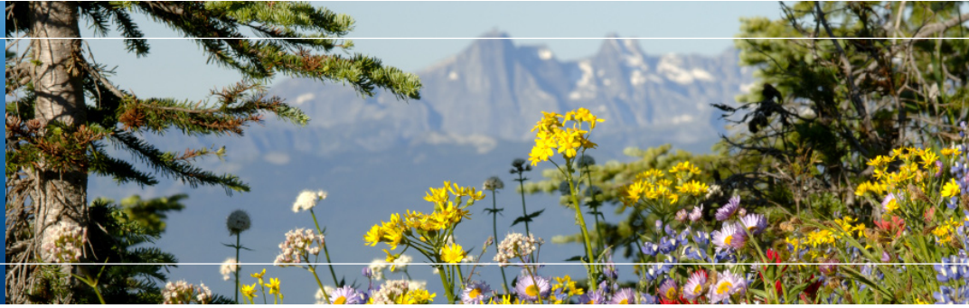
Selkirk Mountains near New Denver, B.C.