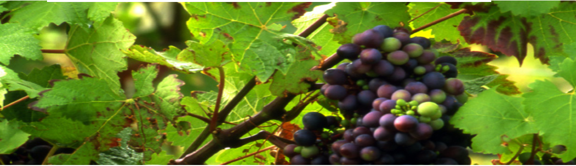
Vineyard, Okanagan Valley, B.C.