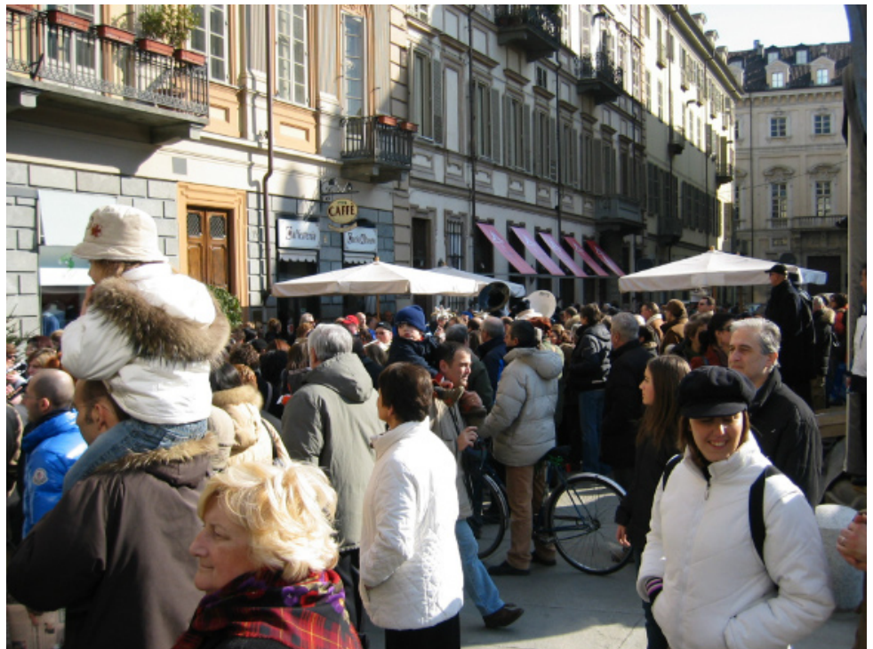
The streets of Turin during the Torino 2006 Winter Games

Check out the Game On 2010 program online by visiting: www.2010CommerceCentre.com and clicking on the Game On 2010 link.