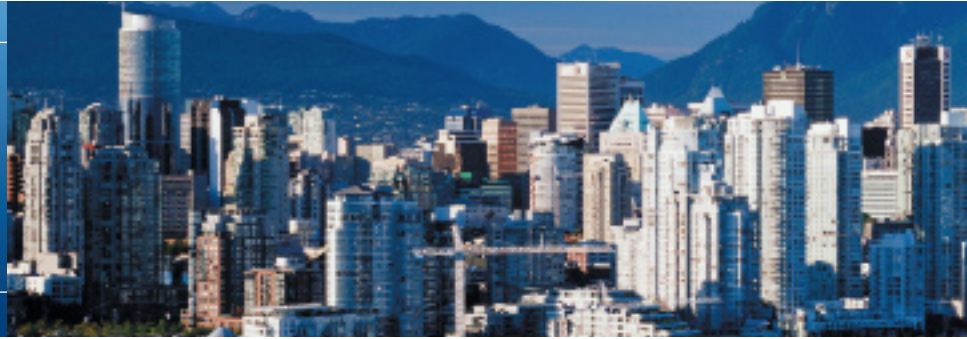
Downtown Vancouver landscape