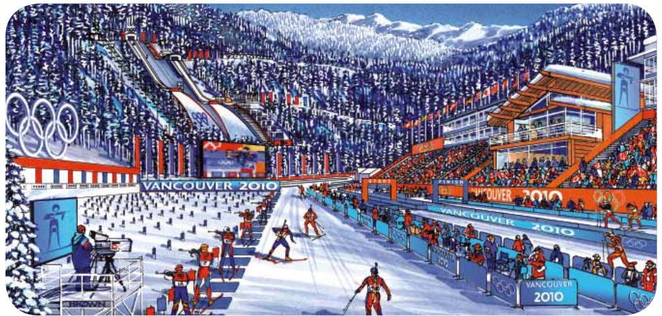
Whistler Nordic Centre Rendering